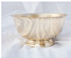
#6003 Brass Initiation Bowl 8" Revere style engraved with wreath, Greek letters and cup