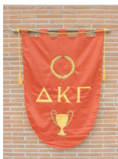
#5090 Official banner, red satin with oak rod support with brass ends, 35" x 52" with applique Greek letters, cup, and wreath