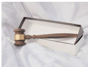
#30127 Chapter President's Rosewood Gavel 7-1/2" engraved with Greek letters