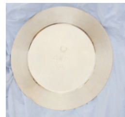
#6002 Brass Initiation Tray 12" engraved with wreath, Greek letters and cup