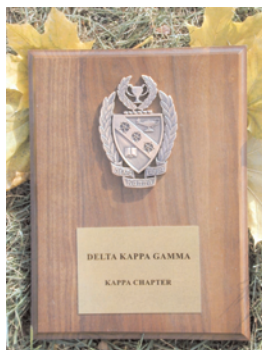
#FFB2 Shield Award Plaque with 5" Bronze Crest and engraved plate. Please specify engraving on back of this form.