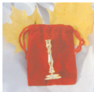
#5061 Miniature Brass Candleholders for Initiates 1-5/8" Tall