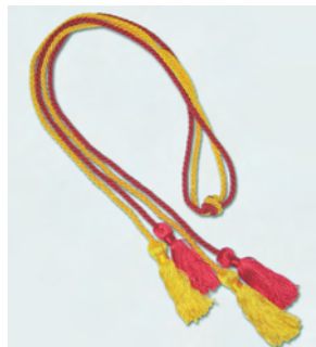
#HCRG Set of Red and Gold Honor Cords