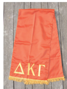
#0000 Official scarf, red satin 18" x 72" with embroidered Greek letters