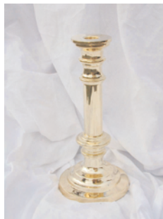
#6001 Brass Initiation Candlestick 9-1/2" engraved with wreath, Greek letters and cup